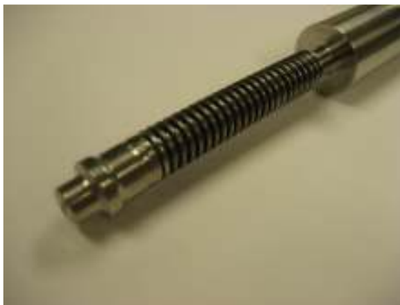
Figure 2 – GT1200-7FA Transducer

Transducers - Davidson fiber optic pressure pulsation transducers are designed for installation through the turbine casing where the existing acoustic waveguides are installed. The transducer design allows the sensor to be positioned flush with the OD of the liner. The transducer probe is flexible to accommodate movement of the liner relative to the casing.